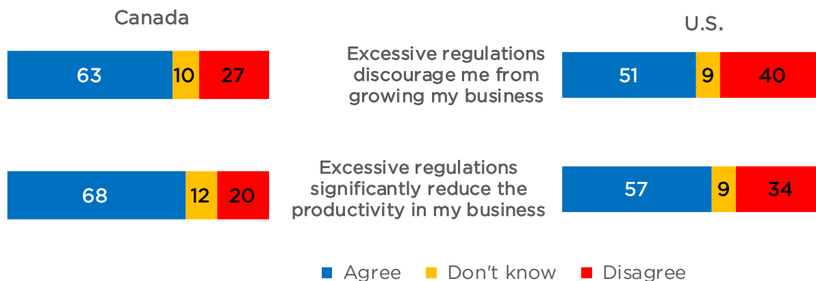
Figure 1: The Effect of Excessive Regulations on the Productivity and Growth of Small- and Medium-Sized Enterprises (% response, Canada and the US)

Sources: CFIB (2012), Survey on Regulation and Paper Burden , n=8,562; and Ipsos Reid (2012), Survey on Regulation and Paper Burden in the United States , n=1,535.